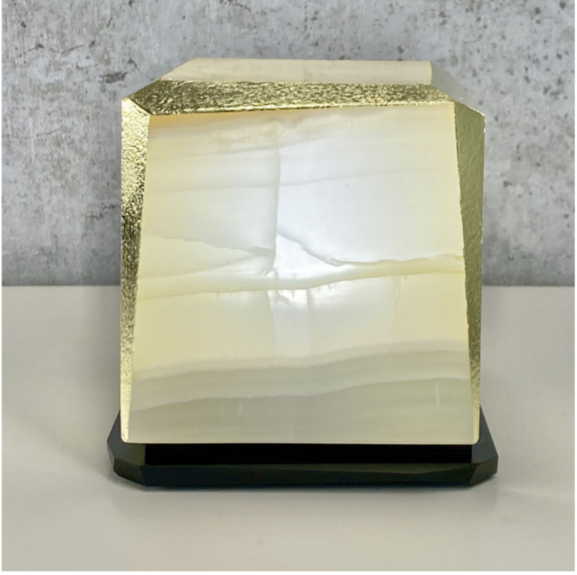
ITSU Two, faceted onyx cube covered with gold leaf (personalized, custom-made)